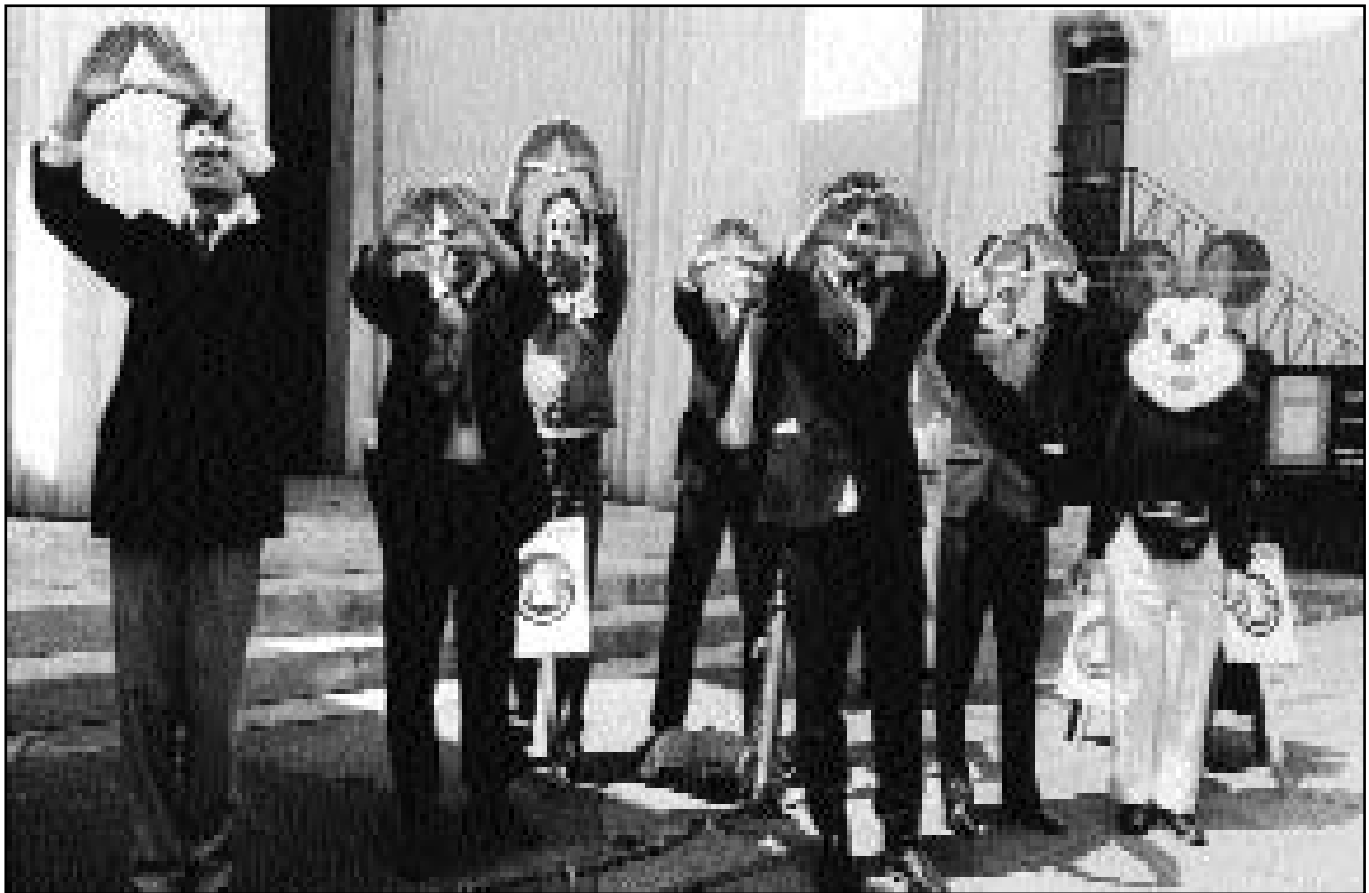
Neoist Alliance Action Against Stockhausen May 1993