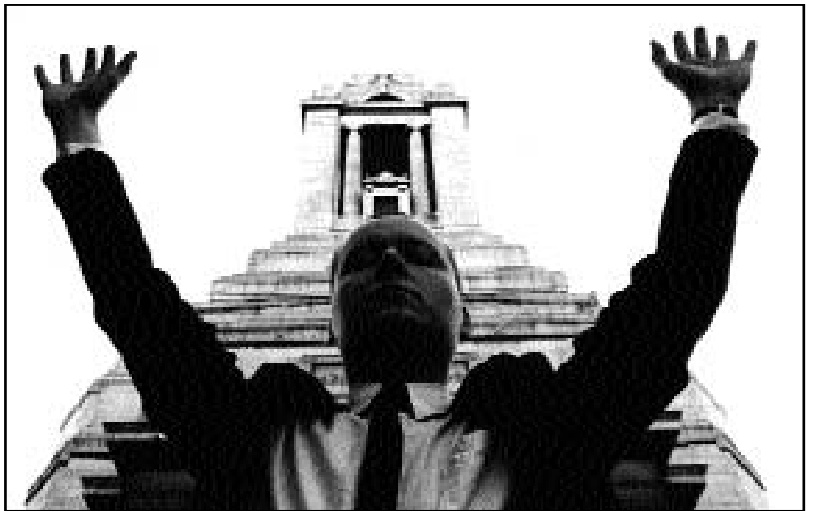
Neoist Alliance Holborn Working Summer 1994