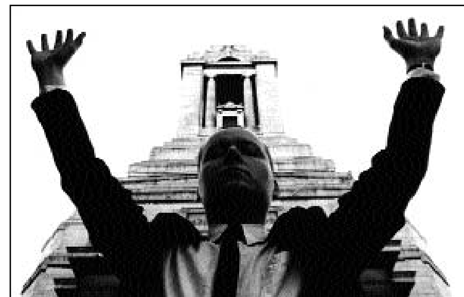
Neoist Alliance Holborn Working Summer 1994