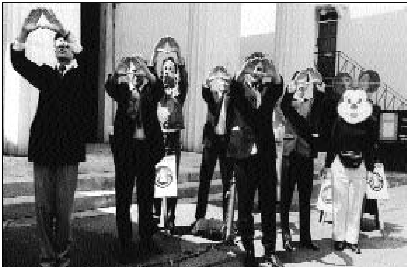
Neoist Alliance Action Against Stockhausen May 1993